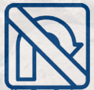
Non Turn Design