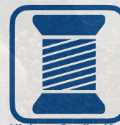
Highest Quality Knit