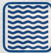
High Density Soft